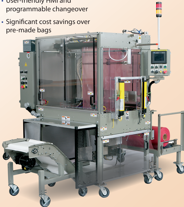
Standard Seal Assembly Horizontal Seal Above Vertical Seal