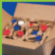
S-shape – Cushions and eliminates abrasion between products