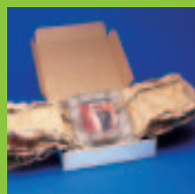
Fold over – Cushion fragile items with protective padding.