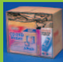
Block and Brace – Strong and durable to hold packages in place