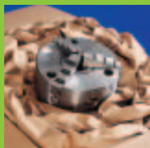
Coil – Superior support to brace and “nest” heavy products.