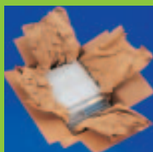
Criss cross – Prevents puncturing of boxes. Ideal to cushion and protect bulky or awkward items.